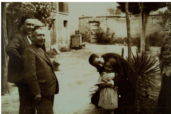
Lluís Companys, First Minister of the Catalan Government, greets his niece on arrival at his family home in Tarròs. Between January and October 1934.

His Catalan patriotism and the rightward shift in the Republican Government led him to proclaim the Catalan State as part of the Spanish Federal Republic on 6 October 1934, and he was imprisoned as a result. At the end of the Civil War he went into exile, but in August 1940 he was arrested by the Gestapo who handed him over to the Franco authorities. After a very short court-martial without due process, Companys was shot at Montjuïc Castle on 15 October 1940. He is the only democratically elected government first minister to have been executed in Spain.