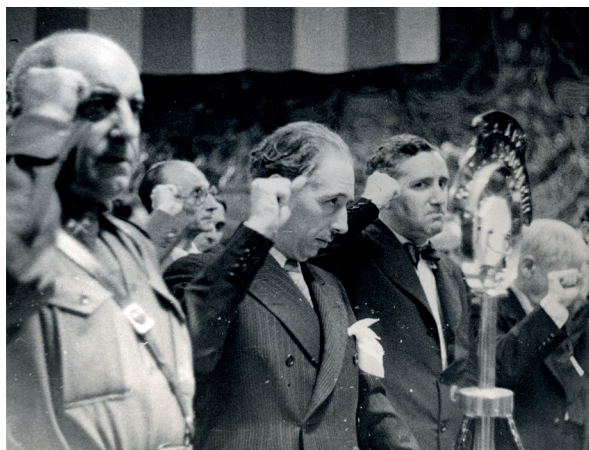
Sebastián Pozas, commander of the Army of the East, Lluís Companys, First Minister of the Catalan Government, and Carles Pi i Sunyer, Catalan Minister of Culture, give a clenched fist salute during the 2nd International Writers Congress in Defence of Culture. Palau de la Música Catalana, Barcelona, 11 July 1937. National Archive of Catalonia.