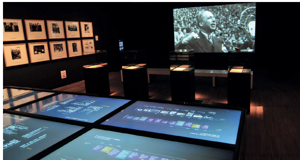
Cover photo: Portrait of Lluís Companys, First Minister of the Catalan Government. Palau de la Generalitat de Catalunya.