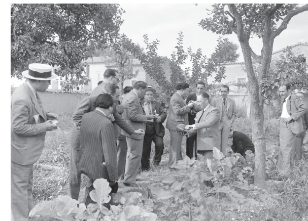
Lluís Companys, First Minister of the Catalan Government, slices a melon in el Tarròs before setting out on a journey in the Aran Valley. His companions include Joan Comorera, Bonaventura Gassol and Joan Alavedra. 19 August 1934.