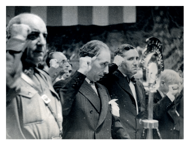
Sebastián Pozas, commander of the Army of the East, Lluís Companys, First Minister of the Catalan Government, and Carles Pi i Sunyer, Catalan Minister of Culture, give a clenched fist salute during the 2nd International Writers Congress in Defence of Culture. Palau de la Música Catalana, Barcelona, 11 July 1937. National Archive of Catalonia.